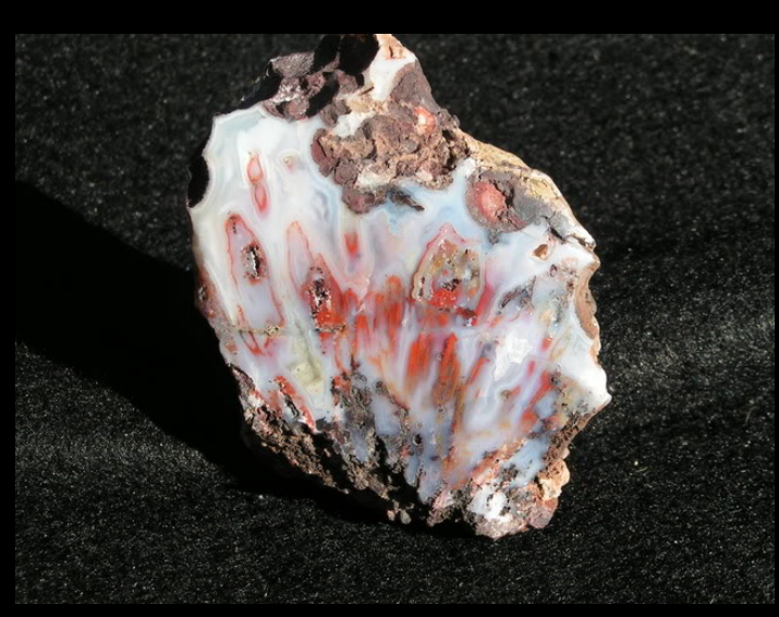
Volume 10A: California Agates